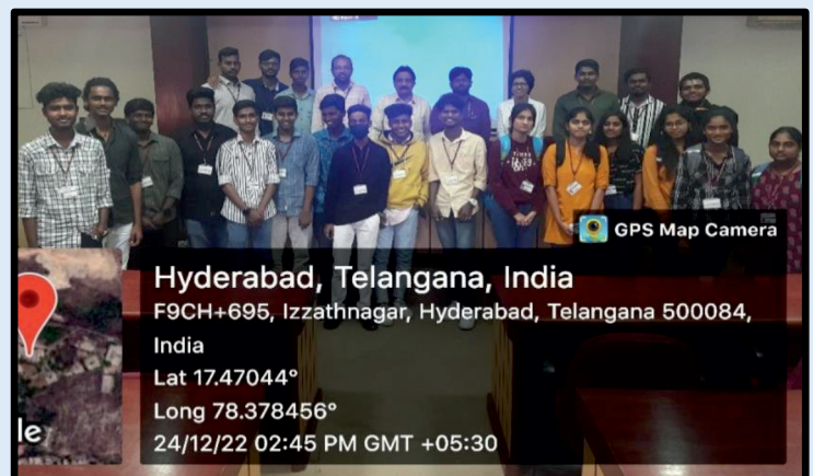
A few snap shots during the visit