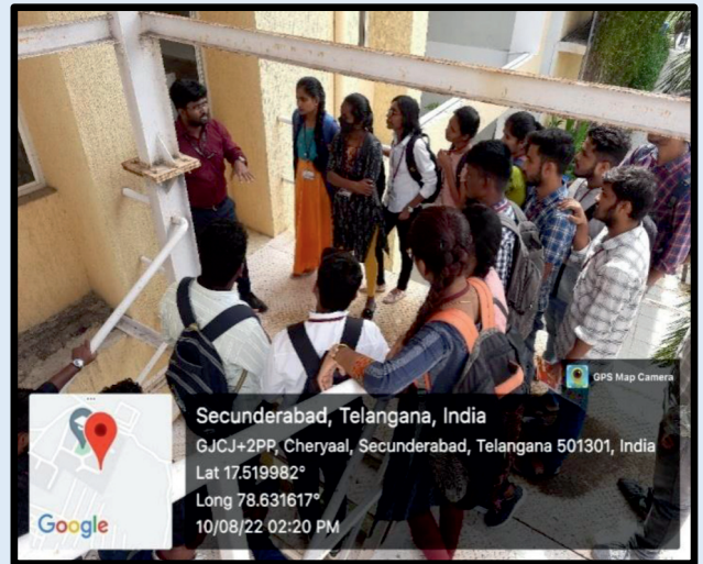
A few snap shots during the visit